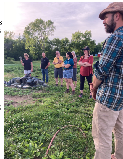
To the right: Attendees at Trinity Acres Farm listening to Gary Cox (out of photo) discuss their operations.